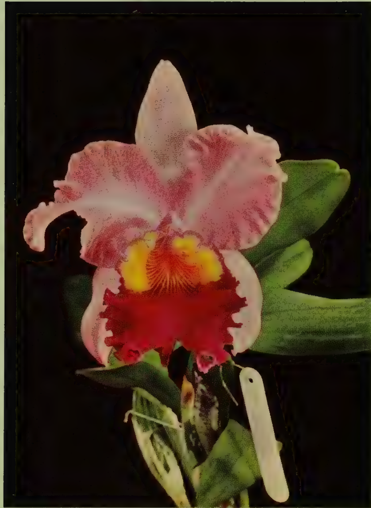
Cattleya Famosa , variety Heritage